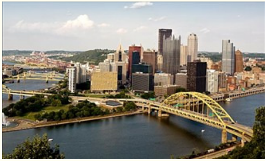
Pittsburgh ranks No. 1 on Forbes.com's list of most livable cities.

Each year, Carnegie Mellon's Tepper School of Business attracts some of the brightest master's degree candidates in the country. But the admissions staff occasionally has to sway prospective students who wonder why they should relocate to Pittsburgh.